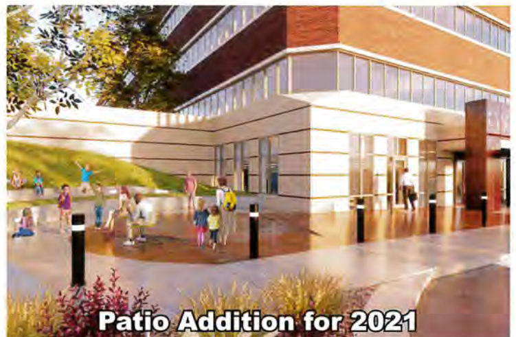
Patio Addition for 2021