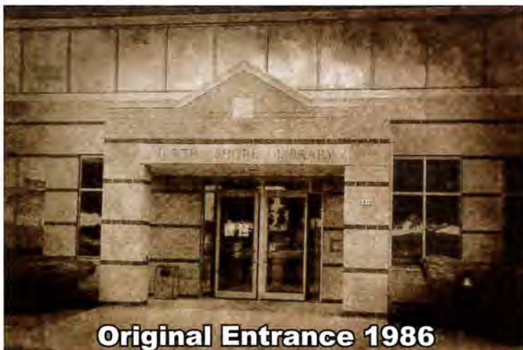
Original Entrance 1986